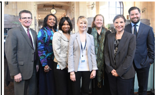
GMH Tower sponsors: Blue Cross and Blue Shield of Kansas City